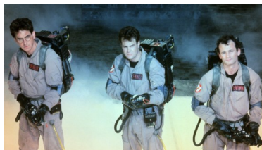
LU's dust busters in action!

An agenda item raised by the RMT at the recent Director's level meeting with LU was the issue of dust levels across the combine. A recent, well publicised survey by Surrey University has again thrust this issue to the fore.