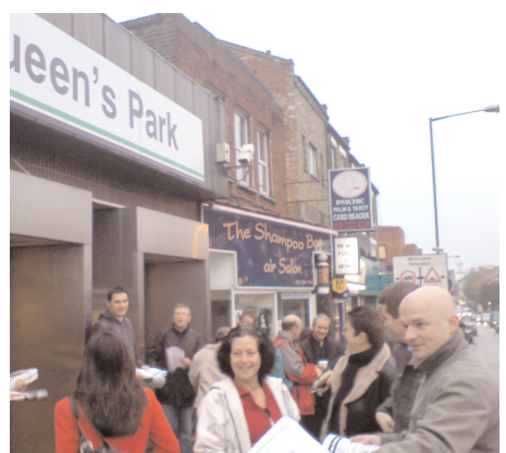
Striking station staff leaflet the public on their strike for safety.

Not one member of detrainment station staff came to work on the last strike day.