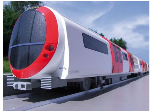
Siemens concept driverless train

Every driver and every grade across the job must resist LU's proposals. They represent a sea change to our culture at work, our culture of safety and our ability to provide a public service for London's travelling public