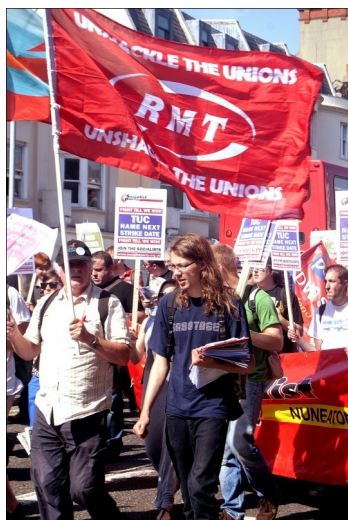
RMT members and Gen Sec Call for Support for General Strike at TUC

RMT will continue to argue for generalised action against austerity but this must not replace strike action