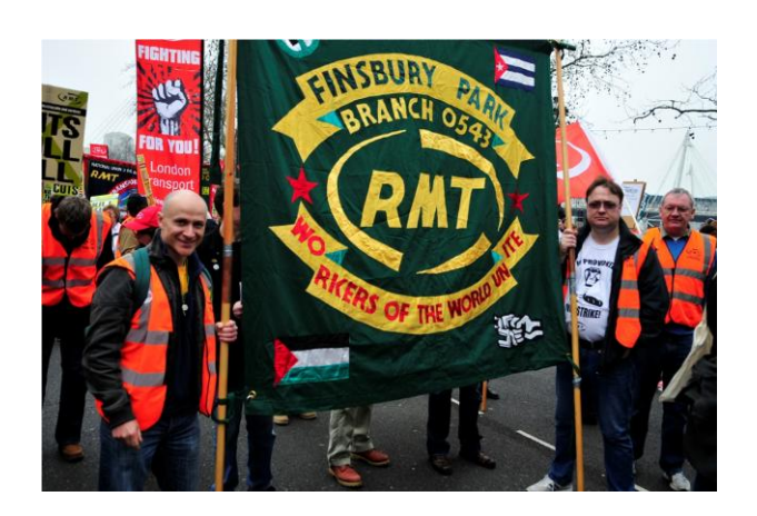
The Finsbury Park branch banner gets another outing

The march should be seen as the opening shot in a huge campaign of resistance to what the government is trying to push through. We need to build upon this great start by ensuring that we fight to defend