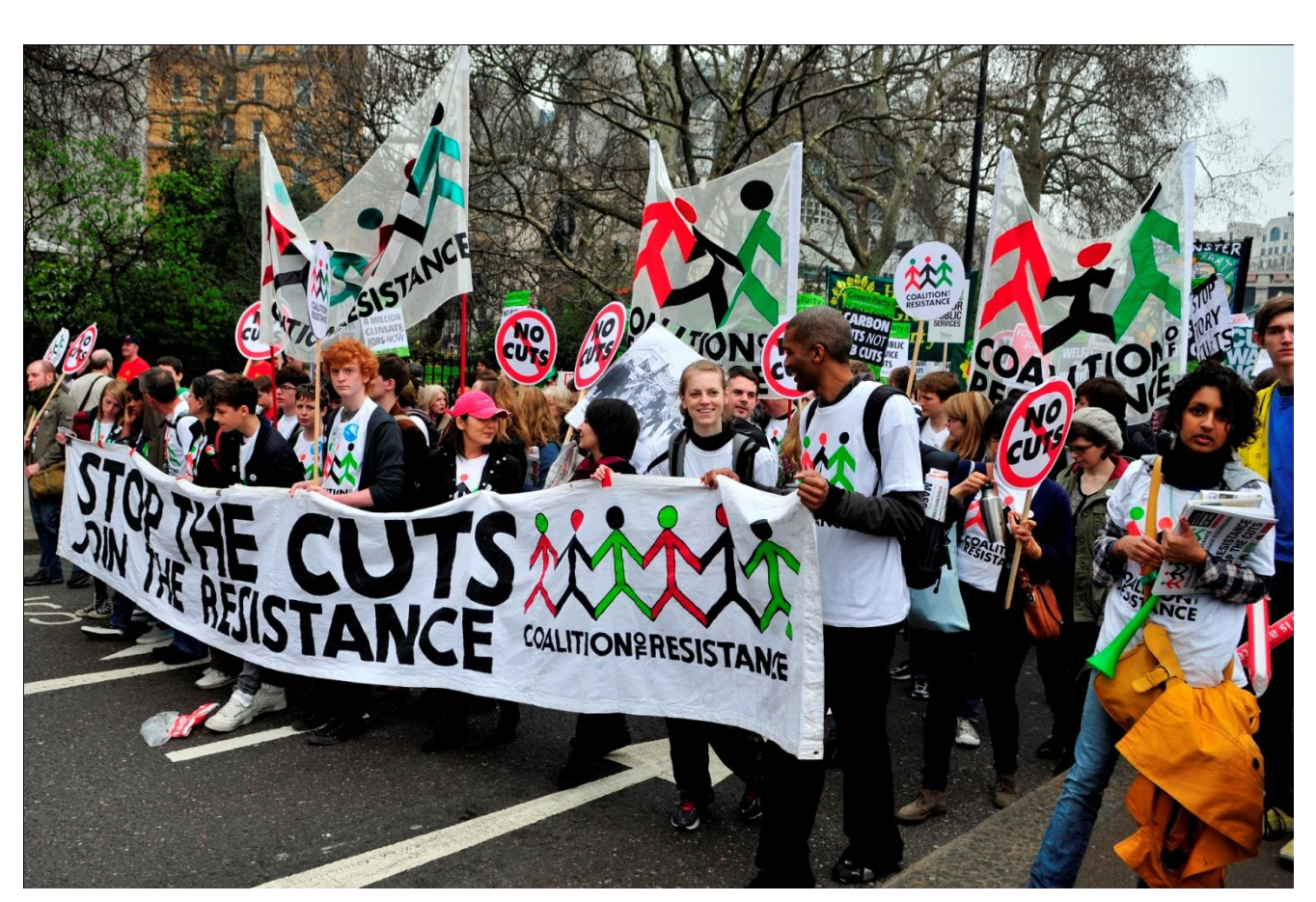
Never mind the ConDem coalition - this is the kind of coalition we need: a coalition of resistance.