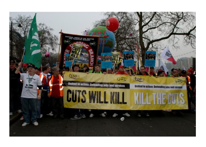
Bob Crow (centre, wearing red cap) spells out our message to the government

RMT made up one of the largest contingents on the march, with Finsbury Park branch adding between 40 and 50 marchers from our own ranks. This was the largest march through London since the million-strong march against the Iraq war in 2003, and showed the depth of feeling against this unholy and undemocratic 'coalition' government of the rich. Will they get the message?